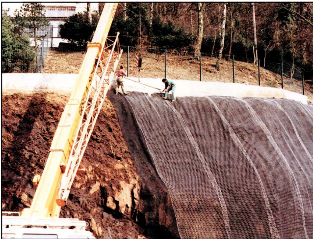
Steep slope before Hydroseeding

Once root growth has begun, the crust will decompose slowly into carbon dioxide and water.