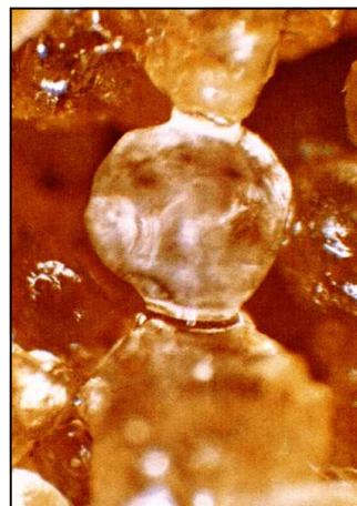
Microsection of bound soil particles