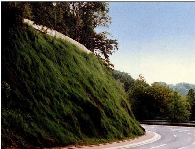
Steep slope after Hydroseeding